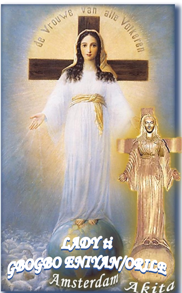
LADY ti GBOGBO ENIYAN/ORILE Amsterdam AKITA